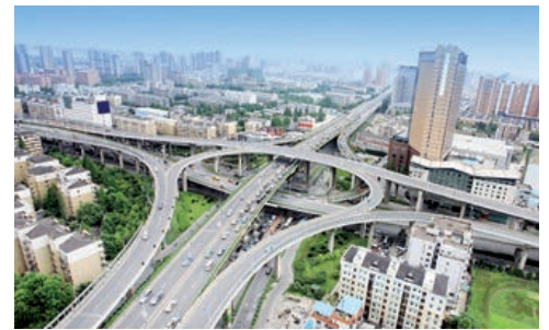
Roads can act as virtual water and carry qi.