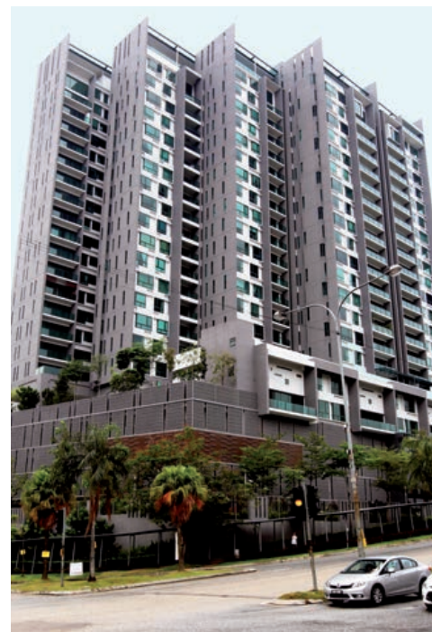
The Treez Jalil Residence is one of the closest high-rise homes to the upcoming Pavilion 2 mall.

Property agents say Bukit Jalil attracts an almost-even mix of owner-occupiers and buy-to-let investors. Many property investors look to rent their units to students while