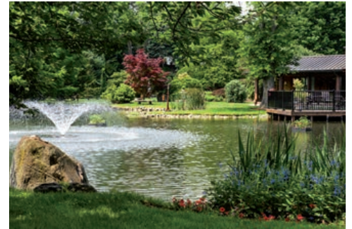
The body of water that a home faces must be calm.