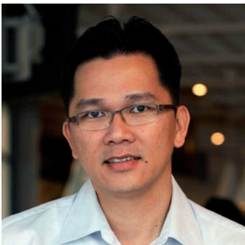
See: As integrated developments with shopping malls or commercial elements are developed, Bukit Jalil can become a self-contained community.

"New supply in Bukit Jalil will be in the form of high-rise strata apartments to cater for the growing population in the area [at] prices within reach of middle income households," he says. Among the non-landed residential projects scheduled for completion in the next three to four years include Casa Green, The Rainz, Parkhill Residences and Twin Arkz.