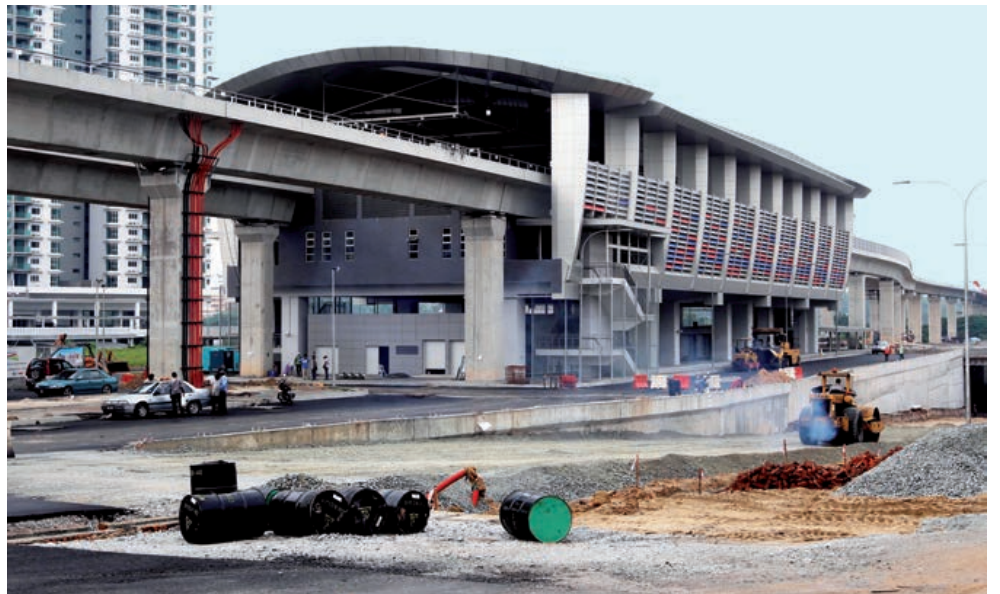
The Ampong LRT line extension is expected to bring better accessibility for Bukit Jalil residents.