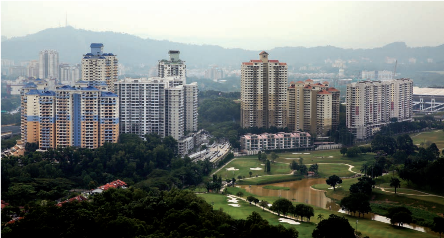
Various condominiums and serviced apartments have been developed in Bukit Jalil over the years.