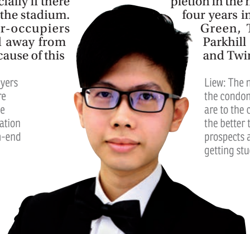
Liew: The nearer the condominiums are to the colleges, the better their prospects are at getting students.