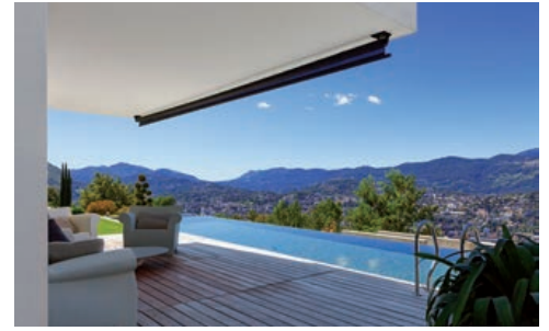
Mountains are an important feature in considering the surrounding environment of a building.