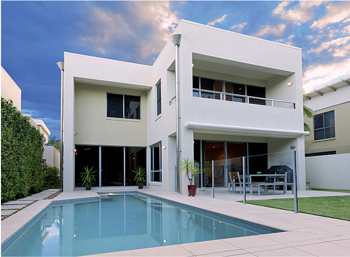
What you really should be looking for is a home with well-balanced feng shui.