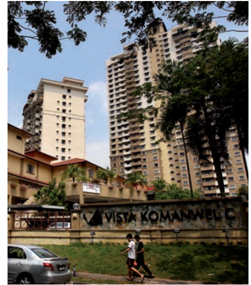
Vista Komanwel Condominiums is one of the earliest high-rise developments in Bukit Jalil.