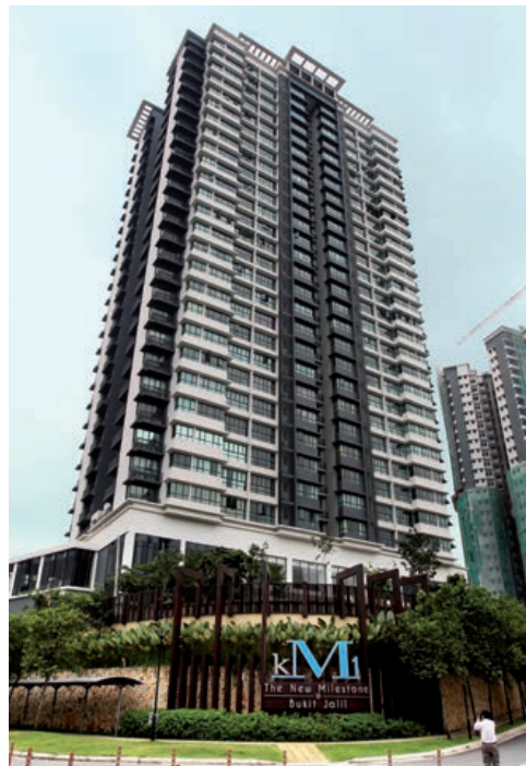
KM1 (West) by Berjaya Land is the most expensive condo in Bukit Jalil by average price psf.

Today, that parcel holds an 18-hole golf course and clubhouse, primary and second-