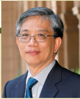
HARIS HASSAN | TheEdgeProperty.com

Tang: Land investment is a safer option compared with other investment tools.