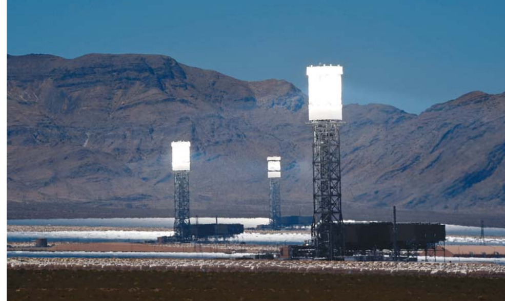
Three towers at the Ivanpah Solar Electric Generating System are shown in operation in the Mojave Desert in California.

this year due, in part, to a record number of people rushing to sign up in 2016 for fear of losing a tax incentive, the market is expected to continue to grow, especially in places like California which has a plethora of sunny days, experts say.