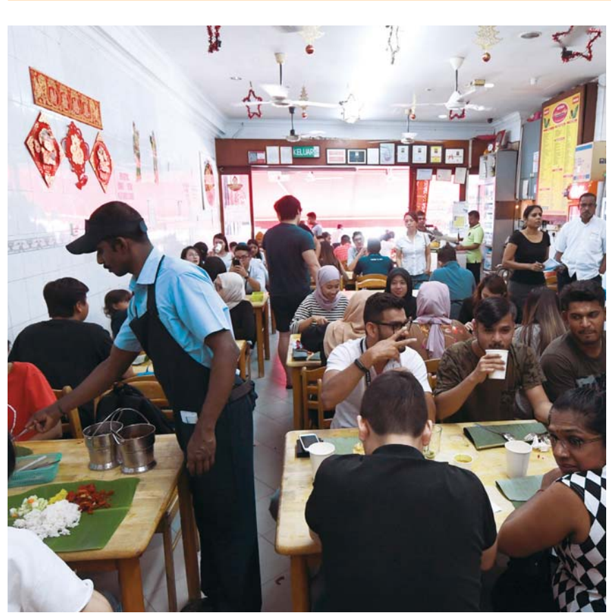
Banana leaf rice for lunch on a workday is ill-advised, as it will induce a 'food coma'. warning), do not consume rental of RM5.76 psf.