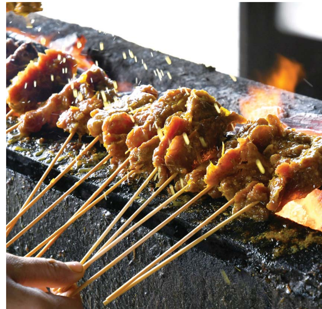
Satay is a grilled meat on bamboo skewers, served with pieces of raw cucumber and onion.

EdgeProp.my's data of transactions showed that shoplots in Bandar Kajang were transacted at an average price from RM202 psf to RM779 psf from 2012 to 2018.