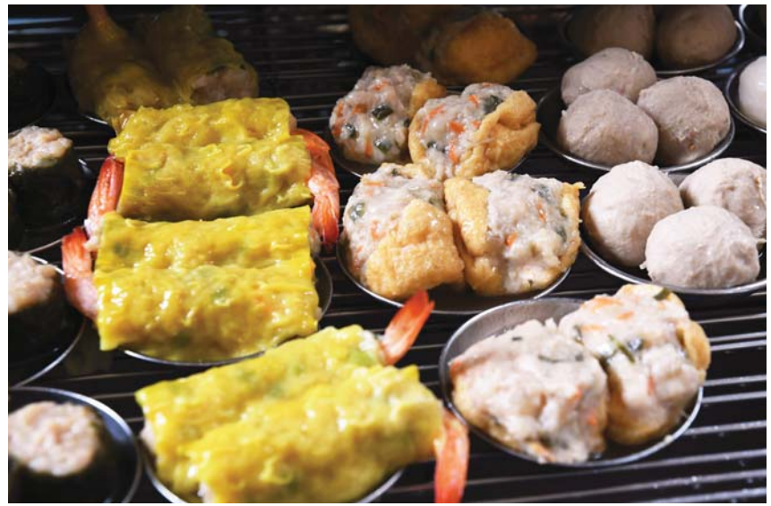
Fishballs, siew mai and barbecue pork buns are popular Dim Sum choices.