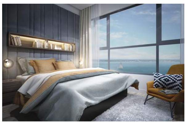
Top: An artist's impression of Savio @ Riana Dutamas.

Left: 3 Residence in Penang with scenic views from the bedroom.