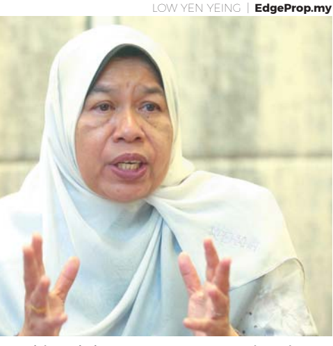
mission is successful.

"When I go down to the field and meet the B40 community, I always urge them to take care of the cleanliness of their houses and ensure the safety of the premises. Because when you want to upgrade or