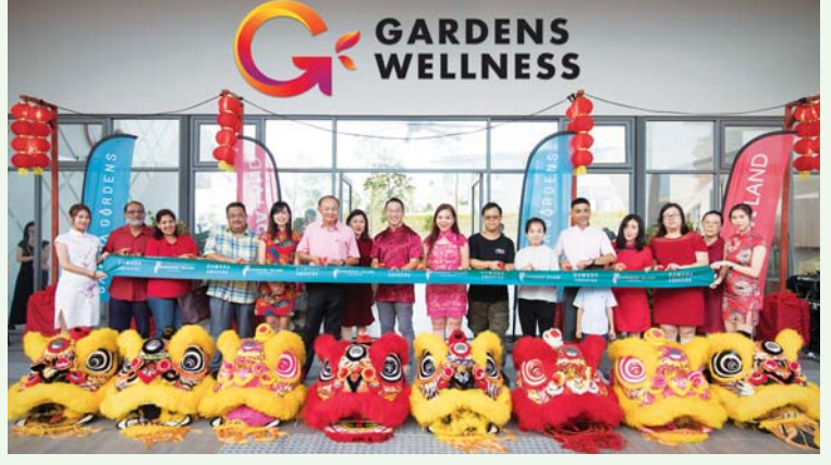
The ribbon-cutting ceremony to mark the opening of the Gardens Wellness centre

retail village with the outdoor natural setting which encourages people to enjoy the outdoors and provides a relaxing vibe. For instance, nothing separates the lower ground floor of the retail village from the green lawn beside the lake, while the ground floor Confirmed tenants to date include features a huge balcony that allows