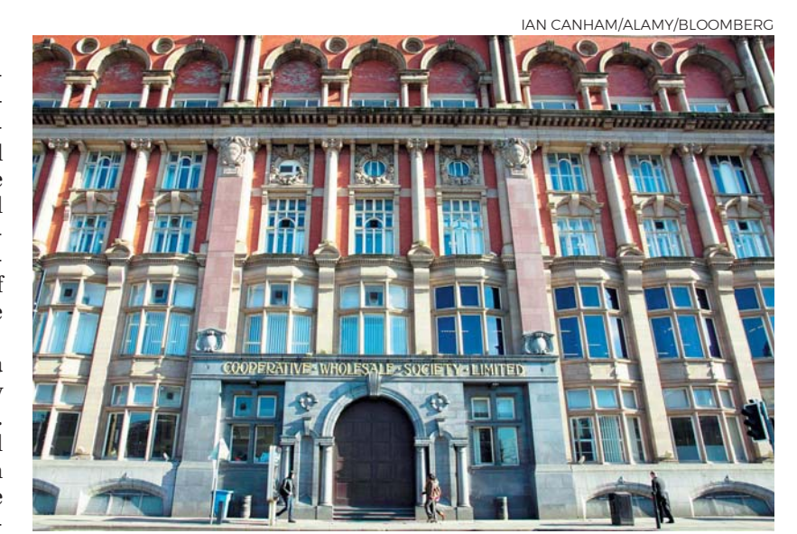
Hanover building in Manchester

The new office is nestled in a district populated with trendy bars, theaters and cultural history. The city's 15th-century cathedral is about as equal a walk away from Amazon's northern home as the Manchester Arena concert ven-